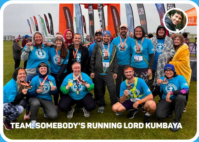
TEAM: SOMEBODY'S RUNNING LORD KUMBAYA