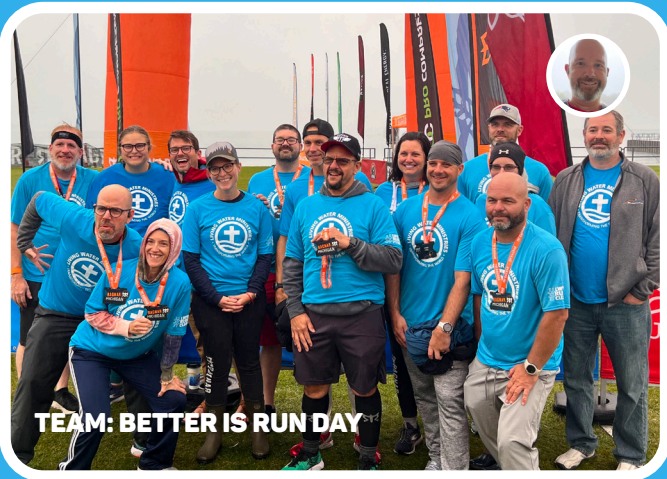
TEAM: BETTER IS RUN DAY